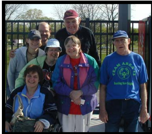
Above: A group of customers enjoying a Loons Game.