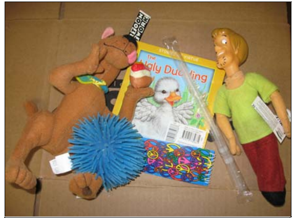
Pictured here is a sample prize pack.

Midland Fund Raising has returned for their 4th year with the Arnold Center.