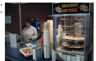
Center Court Cafe

Successes like these result only from the commitment and collaboration of many community partners and the support of an extraordinary community. Thank you Midland! Good luck in business to these entrepreneurs, and may they serve as an example to other budding entrepreneurs that with hard work and the support of a great community like Midland they too can turn their dreams into realities.