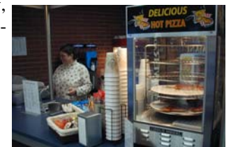
Center Court Cafe

Successes like these result only from the commitment and collaboration of many community partners and the support of an extraordinary community. Thank you Midland! Good luck in business to these entrepreneurs, and may they serve as an example to other budding entrepreneurs that with hard work and the support of a great community like Midland they too can turn their dreams into realities.