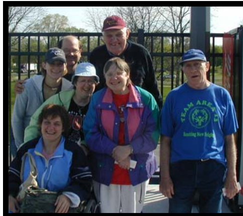
Above: A group of customers enjoying a Loons Game.