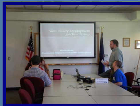
Community Employment Job Club